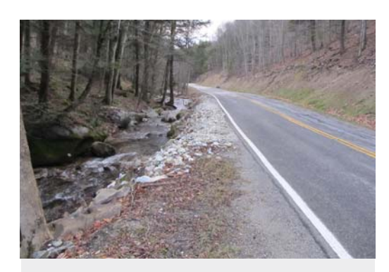
View looking West At area of stream to be stabilized

Detour of Traffic: Traffic will be detoured utilizing VT Route 103 and US Route 7.