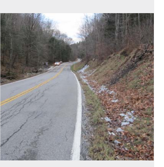
Existing view Looking West

Design Complete Summer 2017 Bid Advertisement September 27, 2017 Contract Award November 28, 2017 Begin Construction Spring 2018 VT 140 Closure/Earthwork June-August 2018